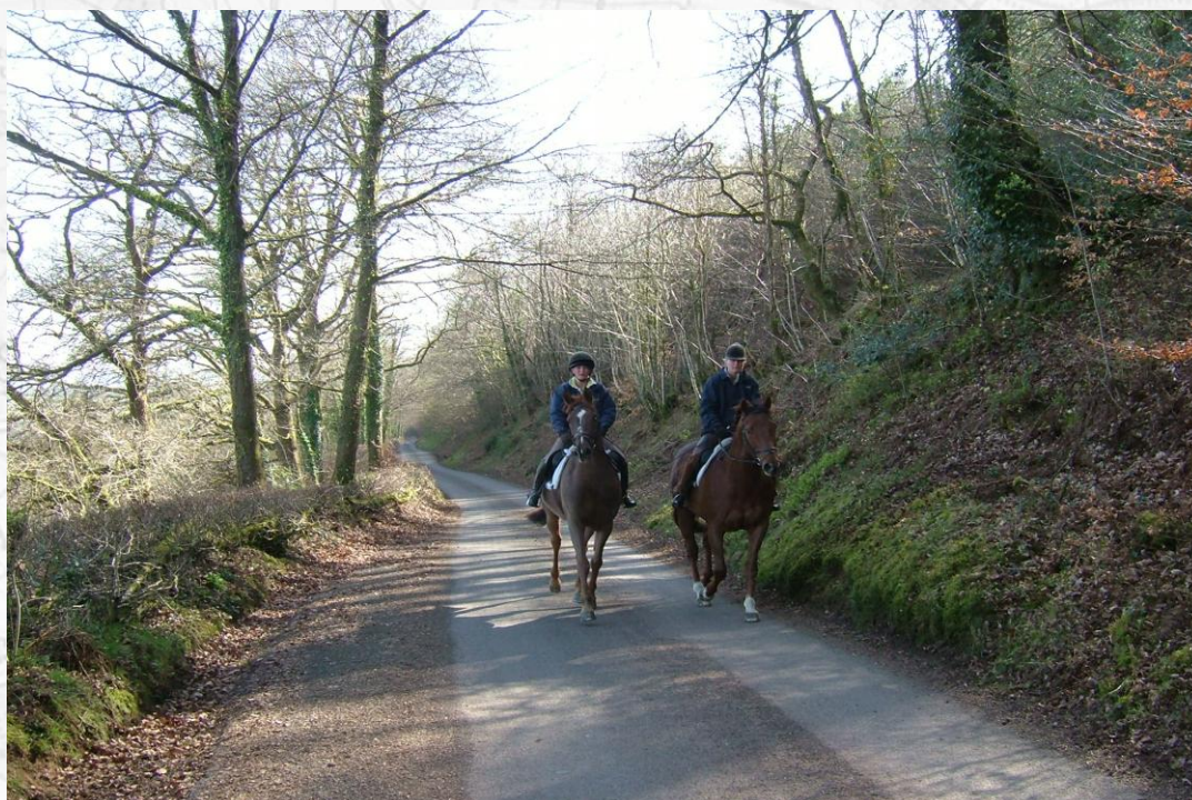
Figure 1. Leisure, Education & Youth