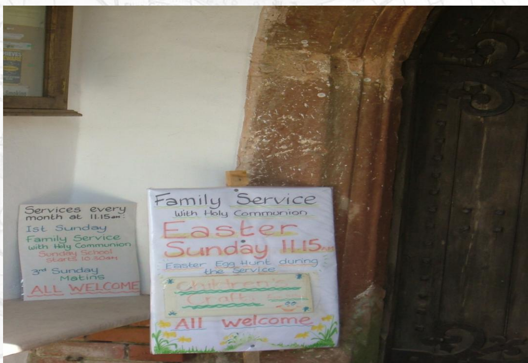
Figure 2. Communication